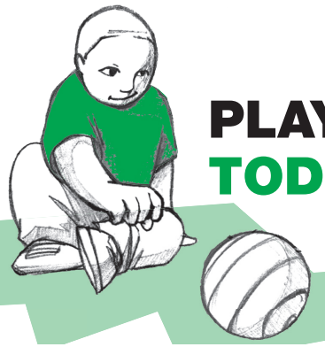
Illustration by Billy Nuñez, age 16